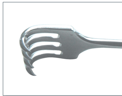
| Stille-Randquist Instruments |

The Stille-Randquist partnership has not only created a more well thought, stream lined surgical procedure but also a more efficient set of surgical instruments.